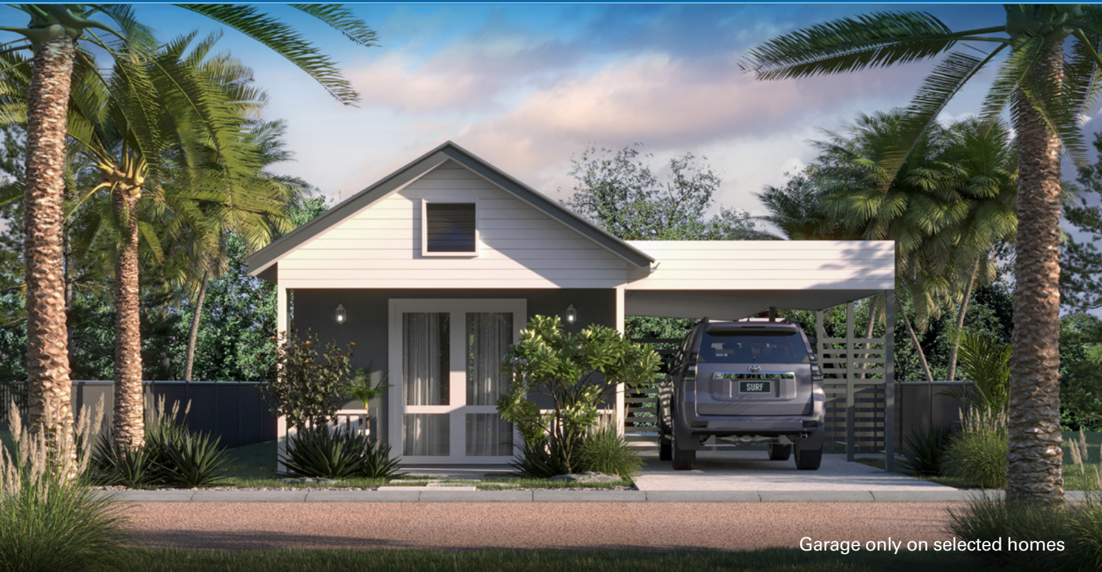
Garage only on selected homes