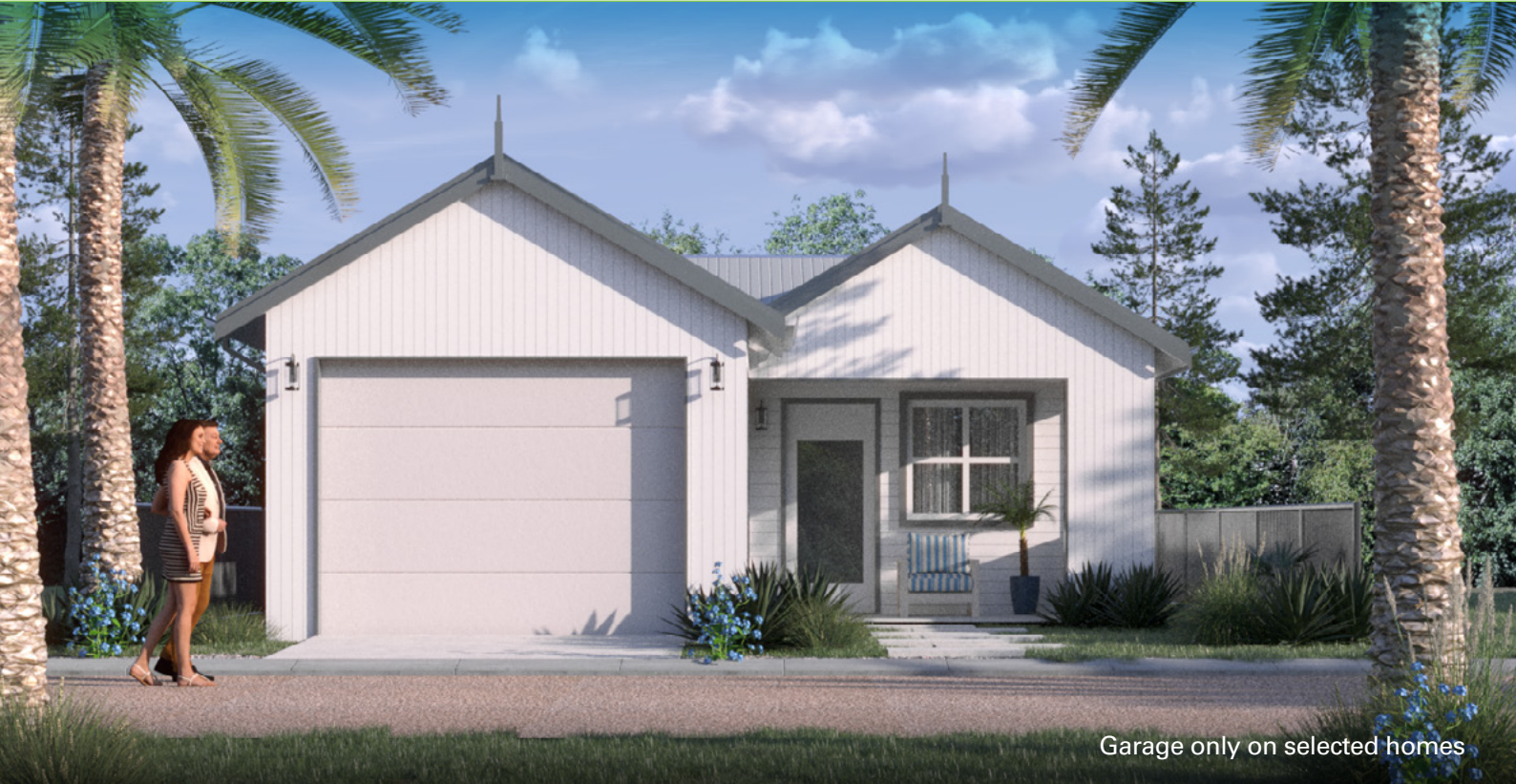
Garage only on selected homes