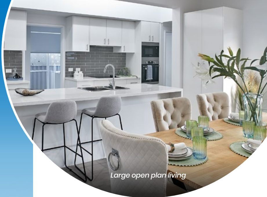
Large open plan living