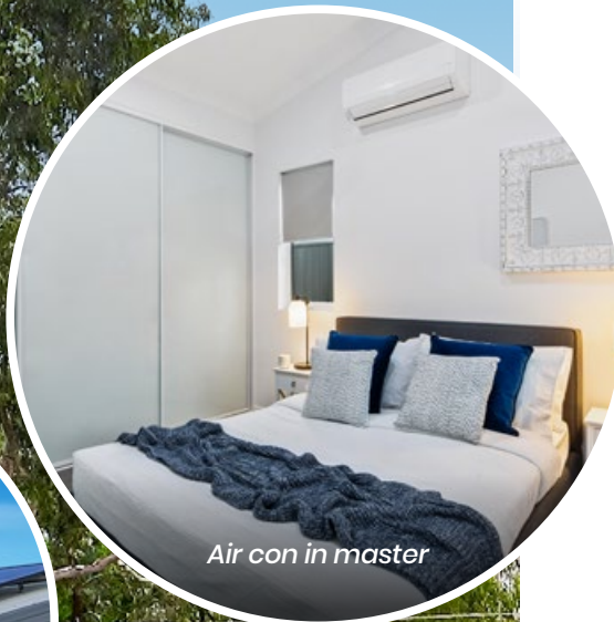
Air con in master