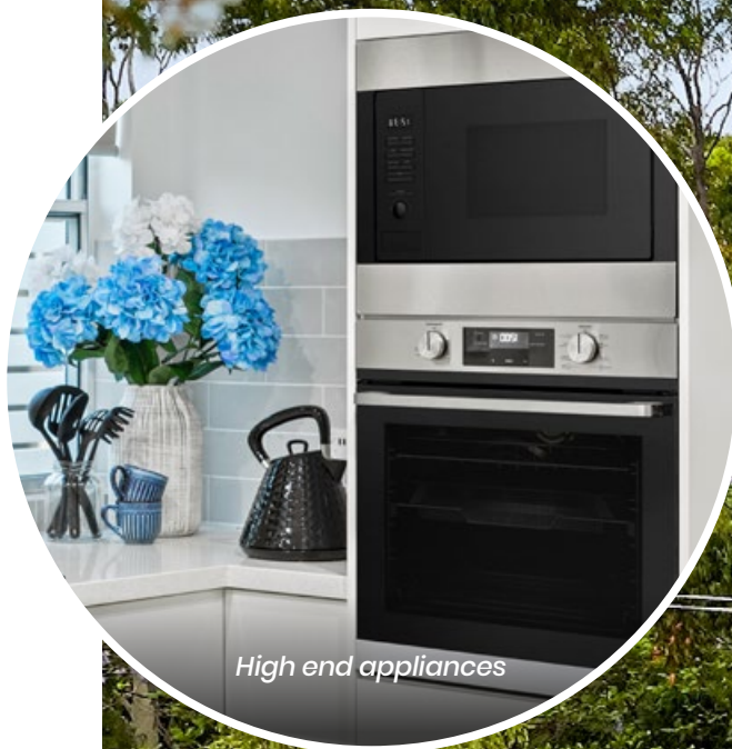
High end appliances