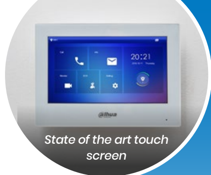
State of the art touch screen