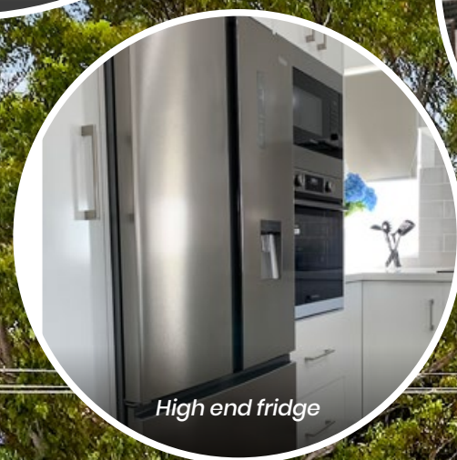
High end fridge