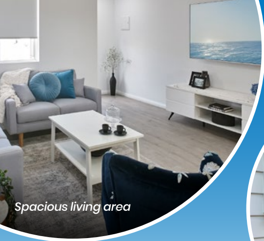
Spacious living area