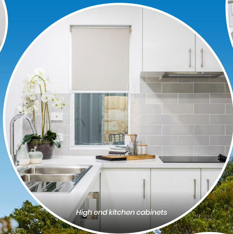
High end kitchen cabinets