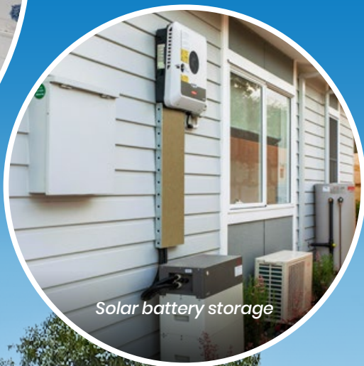
Solar battery storage