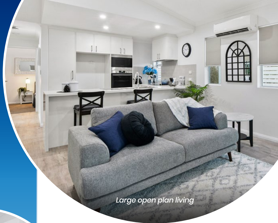
Large open plan living