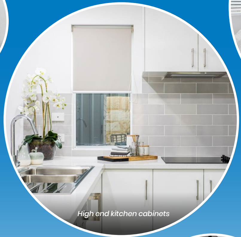
High end kitchen cabinets