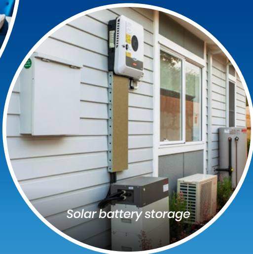
Solar battery storage