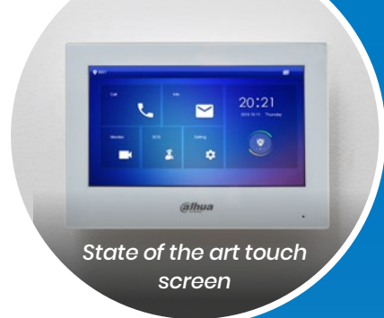
State of the art touch screen