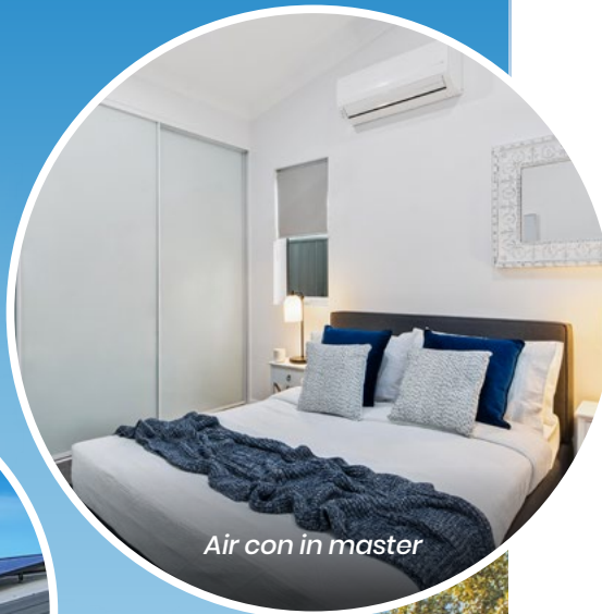
Air con in master